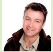
Chris Beardshaw Leading Horticultural Broadcaster

"Gardeners know that the soil is the foundation of great gardens. In our show gardens and private gardens we've found that using Rolawn's Blended Loam gets plants off to the best possible start."